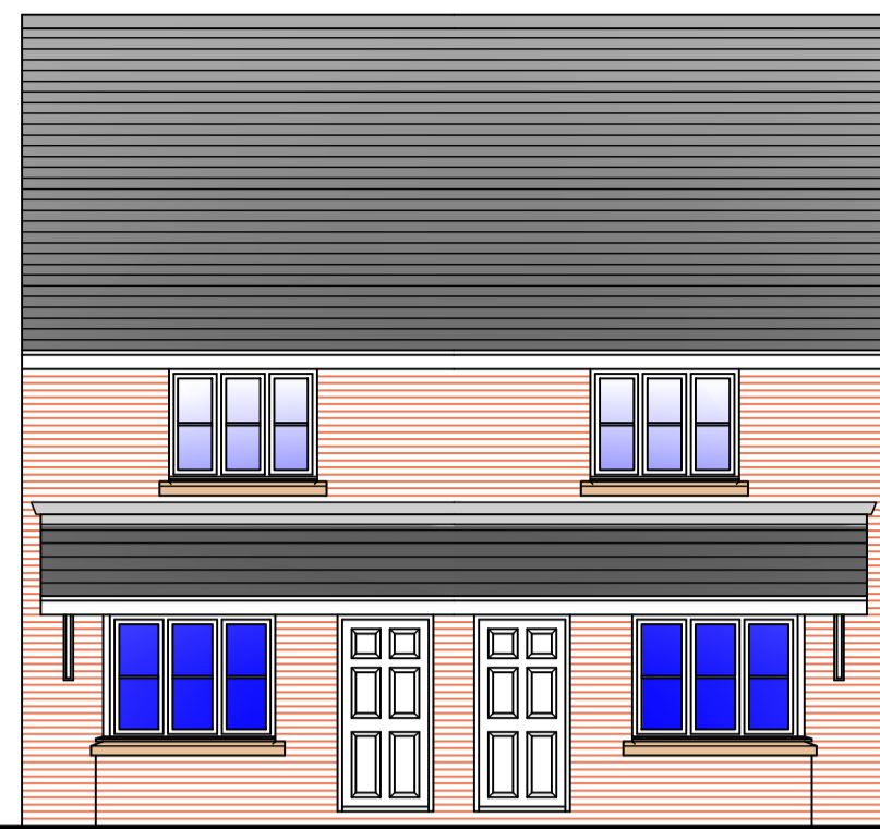
Plot 6 Plot 5 FRONT ELEVATION 3BH930