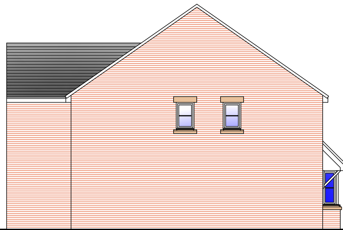
Plot 6 (Plot 5 handed) SIDE ELEVATION