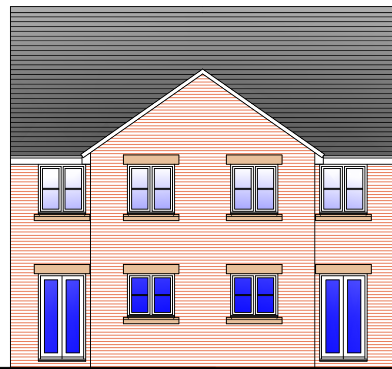
Plot 5 Plot 6 REAR ELEVATION